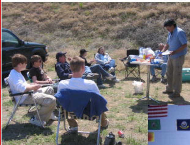
Chow time at the range!