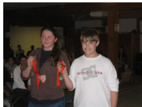
A little hardware to bring home!